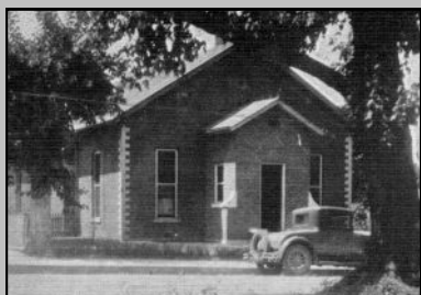
The Moore Clinic